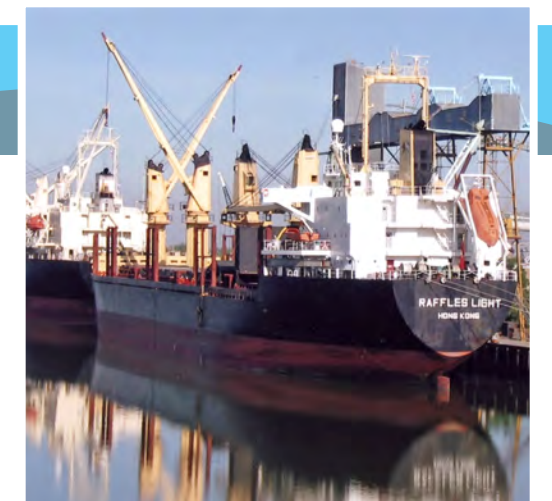
35' Deepening Project: Congressionally authorized construction to add five feet in depth to the Sacramento Deep Water Channel.