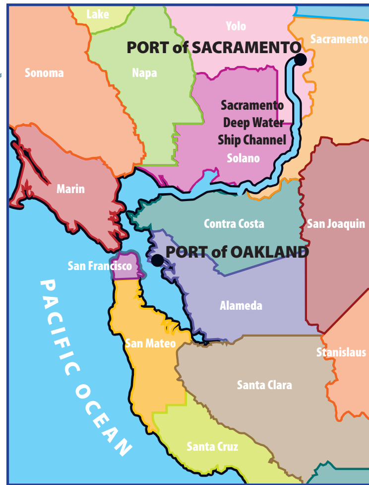
The Sacramento Deep Water Ship Channel: Provides the Sacramento Region with maritime access to the Pacific Ocean